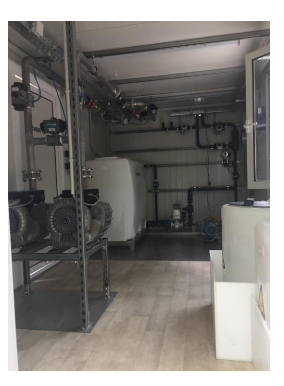
Figure 3. Images of the MBR used in NextGen project.