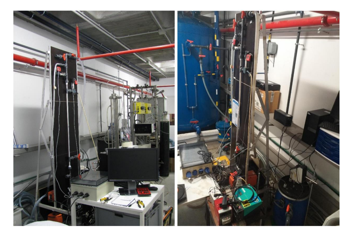
Fig. 2 Pictures of the AnDFCm apparatus (Aqualia)